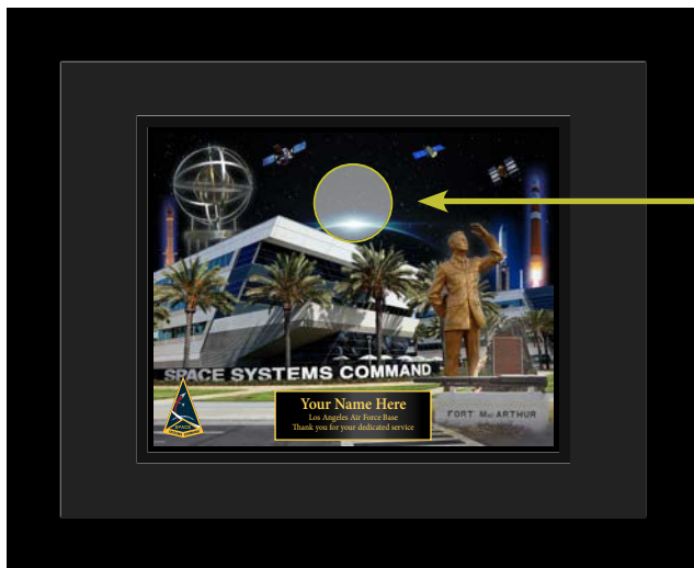
printed text box location